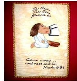
Come Away and Rest Awhile -Mark 6:31